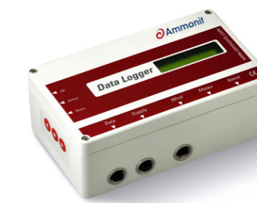
P2500 - WICOM-32