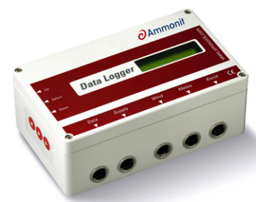
P2520 - METEO-32X