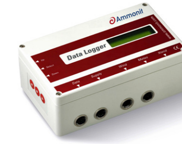
P2510 - METEO-32