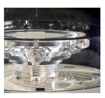
Optical lens New efficient omnidirectional lens.