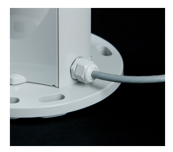
Cable entry From side or bottom of the lantern.