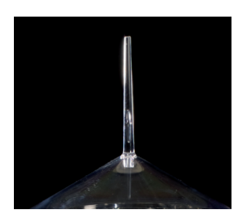
Lens Bird deterrent top design.