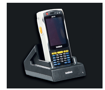
PDA Programmer Wireless two-way communication using a Windows based PDA programmer.