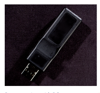
Programming with PC Using Sabik USB interface.