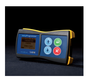
Sabik Easy Programmer User friendly and compact wireless two-way programmer.