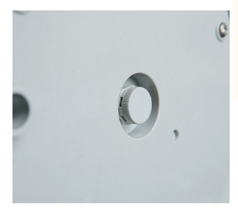
PTFE breathing Vent for pressure release in the bottom of the lantern.