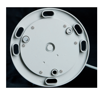
Installation The bottom plate of the LED110 supports installation on structure using 3 or 4 x M12 on a 200 mm diameter or 3 x M8 on a 150 mm diameter.